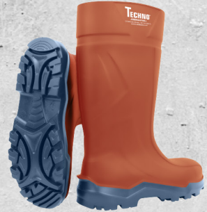
ORANGE / BLUE