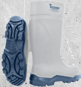
WHITE / BLUE