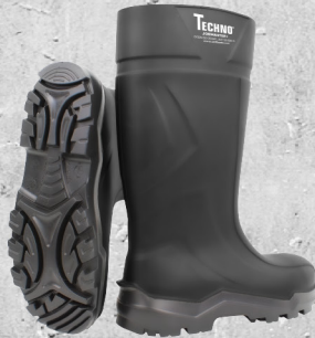
BLACK / BLACK