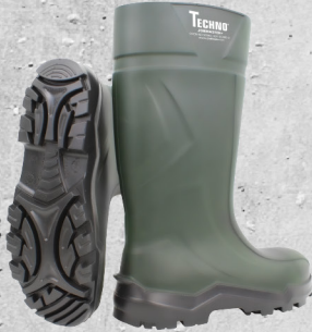
GREEN / BLACK