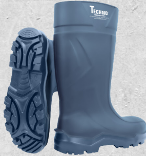
BLUE / BLUE