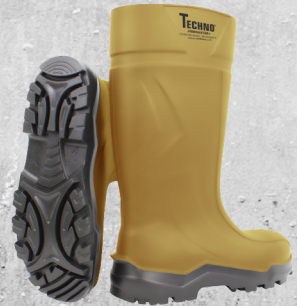
YELLOW / BLACK